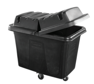
1867538 EXECUTIVE CUBE TRUCK 12 FT.3 WITH QUIET CASTERS - 800-GAL. CAPACITY

Highly maneuverable and versatile waste and linen collection and sortation system. Innovative design delivers improved productivity and ease of use.