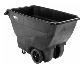
1867540 EXECUTIVE TILT TRUCK 1/2-CUBIC-YARD WITH QUIET CASTERS -450-GAL. CAPACITY

For material transport, and waste and laundry collection, with the durability of rotational molding technology. Also available in 16 ft.3, 1000-Gal. capacity (1867537).